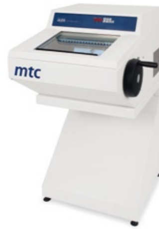
Benchtop Cryostat MTC – optional with height adjustable support