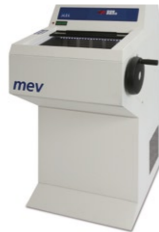
Floorstanding Cryostat MEV

(Specifications are subject to change without notice)