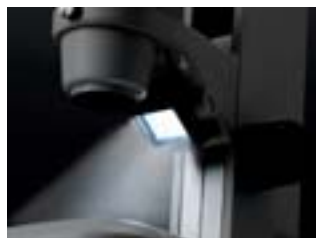
Episcopic illumination (Tilttable 0°-55°)