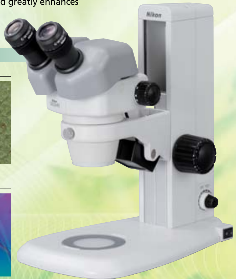
Configured with the LED stand